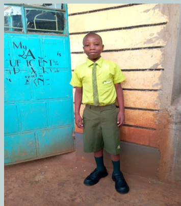
Davies came top in grade 5 and became overall top student in school