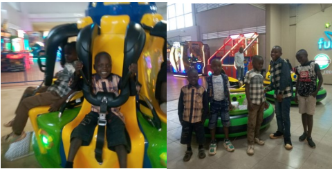
Kids having good time in Kisumu